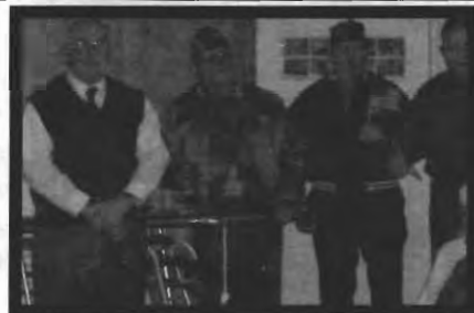
Veteran's Day at Redstone Villa November 11, 2008